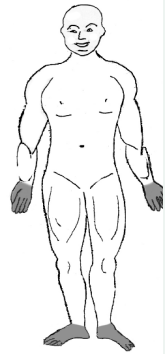
The Four Download Sites (hands and feet) are treated with clay packs first to allow drainage from congested body areas