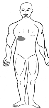
A clay pack applied over the liver area (a key detox organ)